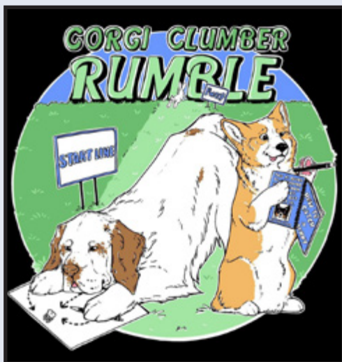
Art by Jackie Barbour Gardner

What a glorious weekend of PWCCP Fast CAT! We had perfect weather October 4, 5, and 6 for three days of racing. On Friday we celebrated the 4th Corgi Clumber Rumble with 26 corgis and 17 clumbers chasing the lure and competing against the clock. We capped the day with a groaning board picnic where we awarded gorgeous rosettes and shared lots of food and laughter. We even had a surprise wedding shower for one of our volunteers!